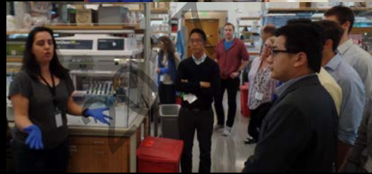
Pausing to speak with a JCVI scientist