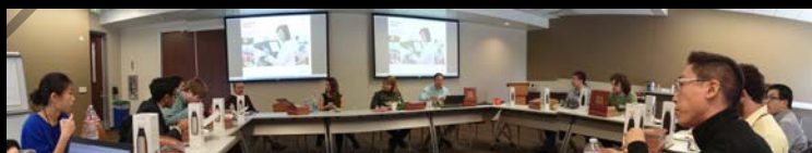
Career discussion and lunch with Caltech alumni at Illumina