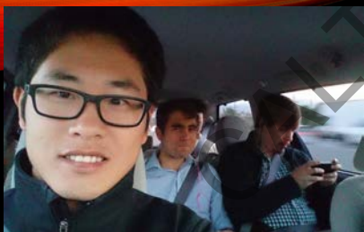
The (long) van ride to San Diego