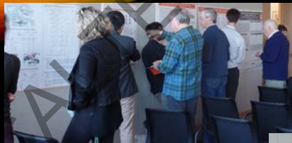
The poster session sparked numerous conversations