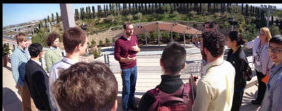
Tour of Illumina's beautiful campus in San Diego